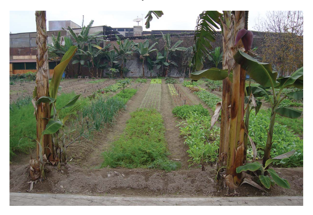
Figure 7 Public green space and urban agriculture irrigated with wastewater in Lima, Peru.