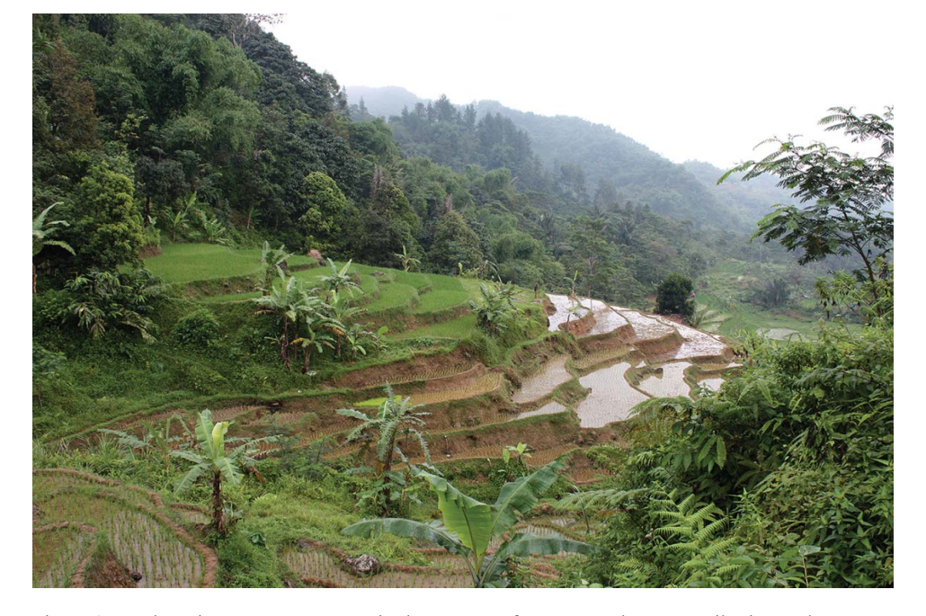
Figure 3. Indonesian agro-ecosystems in the context of REDD+.

deploying REDD+ mechanisms at a national level (Norway 2010; Edwards, Koh, and Laurance 2012).